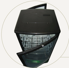
Double lockable curved doors