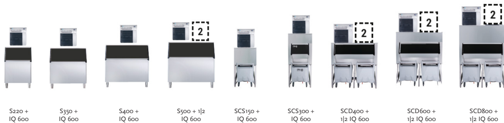
S220 + IQ 600 S330 + IQ 600 S400 + IQ 600 S500 + 1/2 IQ 600 SCS150 + IQ 600 SCS300 + IQ 600 SCD400 + 1/2 IQ 600 SCD600 + 1/2 IQ 600 SCD800 + 1/2 IQ 600