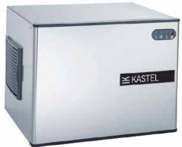
6gr or 10gr or 17gr SQUARED ICE CUBE

With their superior cooling performance and low production costs, solid square cubes offer the best solution for all situations where high ice consumption is needed.