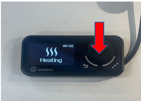
2) Press Knob TWICE