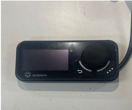
Normal Blank Screen