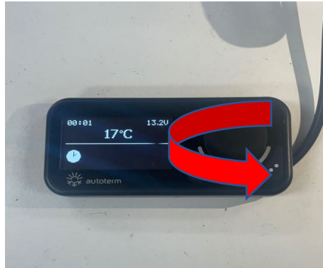
1) Turn Main Knob to bring screen to life