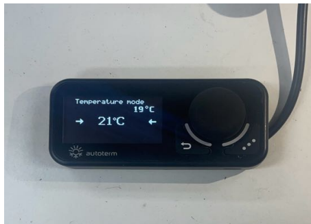
This brings up the Temperature setting screen