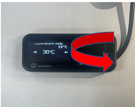
3) Turn Knob to the desired Room Temperature