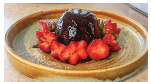
Even cooking and heating results